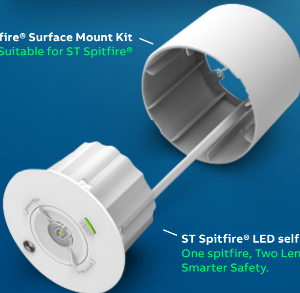
ST Spitfire® LED self test One spitfire, Two Lenses. Smarter Safety.