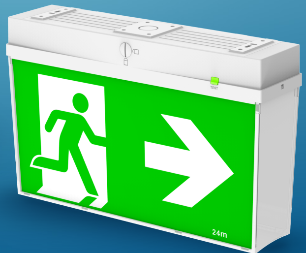
ST Quick multifix LED exit self test One Exit, Five Solutions. Smarter Safety.